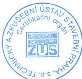
The stamp of the Certification Body

This Annex is an integral part of the certificate No. 040-079249